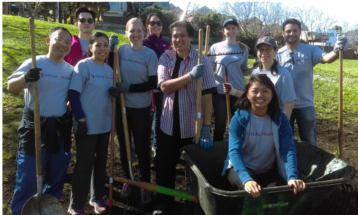
Gilead volunteers participating in a Habitat for Humanity park beautification event

In 2016, more than 400 employees joined the Gilead Volunteer Community and donated their time to help support our local communities.